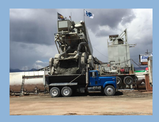
Temporary Concrete Plant Operational