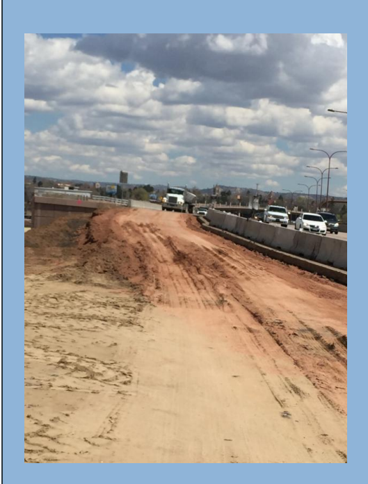
Southbound I-25 Off-Ramp