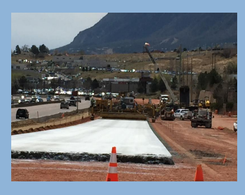
Southbound I-25 On-Ramp