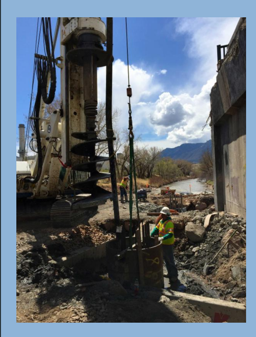
US 24/Cimarron Bridge over Fountain Creek

Be sure to watch for warning signs to direct you, adhere to posted speed limits and avoid distractions.